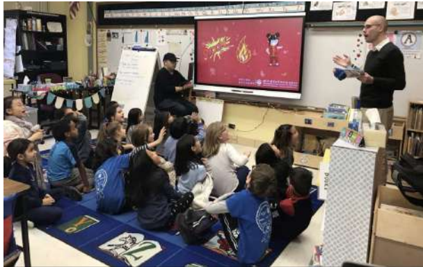
We learn through cultural stories