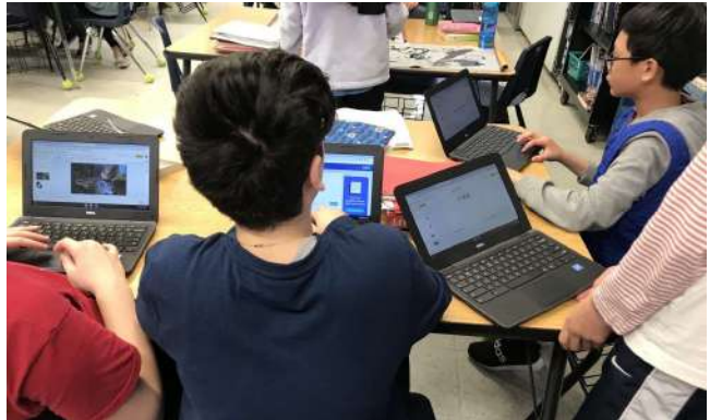
We learn through technology