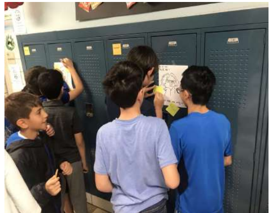
We learn through arts and crafts